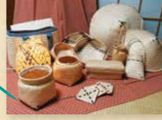
Ishikawa Prefecture designated traditional craft: Japanese cypress crafts (sold at Yokomachi Urarakan)