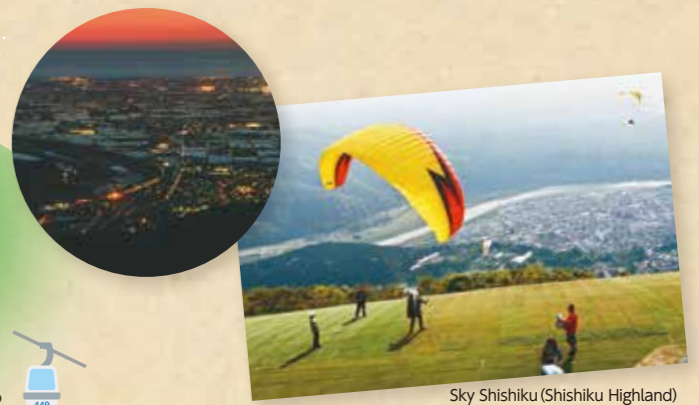
Festival Float Museum (exhibiting floats used during the Horai festival)